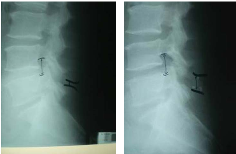
FIGURE 1. Preoperative (left) and postoperative (right) lateral roentgenograms. (Lateral roentgenograms after implantation of interspinous device shows separation of the posterior elements with accompanying unloading of the facet joints, widening the intervertebral foramen and thus decompressing the vertebral canal and relieving the load on the disc).