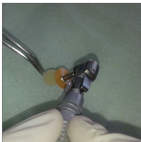
FIGURE 1. Polishing of the specimens.

Fifteen cylindrical samples of each resin composite were prepared using a metallic mold (2 × 10 mm). A microscope glass slide and transparent Mylar® strip were placed under the mold, and the material was packed and covered with another polyethylene terephthalate strip and the glass plate. The samples were light-cured using a wireless LED lamp (Elipar™ FreeLight 2 LED Curing Light, 3M ESPE, St. Paul, MN, USA) with light intensity >1000 mW/cm 2 for 20 s. Dry finishing and polishing of the specimens were accomplished sequentially, using fine (24 μm) and superfine-grit (8 μm) Sof-Lex polishing disks (3M, ESPE, St. Paul, MN, USA), a new for each specimen (Figure 1). The aluminum oxide polishing disks were inserted in a low-speed dental handpiece with air cooling (at 10.000 rpm), used with repetitive strokes, by applying light pressure on the specimen surface for 10 s per grit. All polishing disks were disposed of after each use. Following the preparation, to complete the polymerization process, the samples were stored in glass containers with distilled water, at 37°C, for