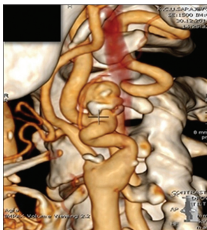
FIGURE 1. Computed tomography angiography (CTA) of the left internal carotid artery (ICA). A berry aneurysm of the left ICA was confirmed by CTA with 3-D reconstructions, which revealed double kinking of the left ICA at 15 mm from the origin, partially thrombosed, and the berry aneurysm measuring 14.2x12.5 mm in diameter, neck widths up to 4 mm. The distal portion of the left ICA preserved a width of circulating lumen.

Classic open surgical approach to the carotid artery with preservation of the neural structures (cranial nerves X and XII) was performed under regional anesthesia (cervical block using a 2% Xylocaine).