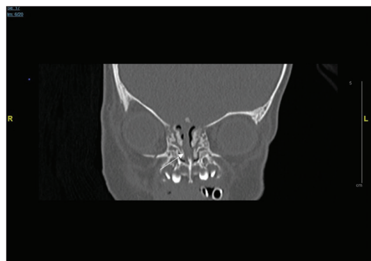
FIGURE 2. Coronal view of the computerized tomography scan shows inferior turbinate hypertrophy causing stenosed nasal cavity (arrow).

ITH is a rare cause of neonatal nasal obstruction (1). This condition and other types of nasal pathologies such as choanal atresia rarely compromise the neonatal airway. Nevertheless, this case illustrates that congenital ITH can be the cause of significant respiratory compromise and morbidity in a neonate. While choanal atresia is one of the best-known nasal cavity anomalies, choanal stenosis, congenital nasal mid-line masses, and congenital nasal pyriform aperture stenosis, and nasal tip anomalies are other causes of neonatal upper respiratory obstruction (3). A thorough examination should be done to differentiate these nasal pathologies. ITH is generally an acquired problem and is encountered in response