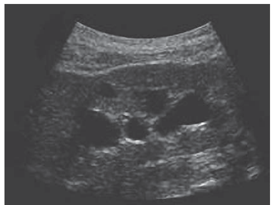
FIGURE 1. In gray scale US examination, there are dilations in all calyx system. The level of dilatation is grade 2-3 hydronephrosis.

clinic. She had big submucous myoma uteri and after diagnosis, she had a hysterectomy operation for myoma uteri. On the 17th day of surgery, she had visited emergency department of our hospital with the chief complaints of left lumbar pain and dysuria. Then, physical, laboratory and radiological evaluations were performed. In physical examination she had left lumbar tenderness and pain.