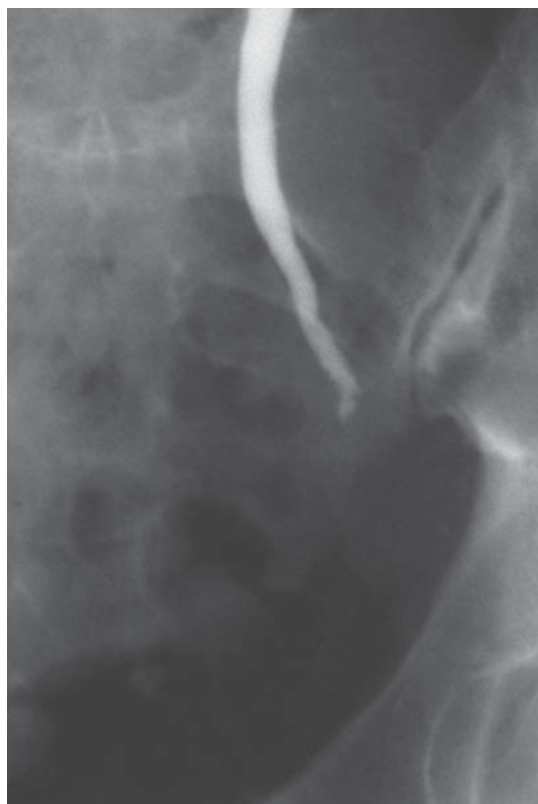
FIGURE 2. In IVU, there is complete obstruction in the lower part of left ureter. Additionally, there is mild dilatation in the proximal part of ureter.