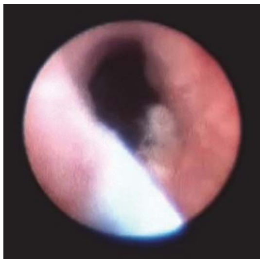
FIGURE 4. Ureteroscopic view of ureter after ureterotomy was performed. Guide wire is also in the ureter.

The urine test and serum creatinine were normal. In ultrasonography (US) examination, there was grade 2-3 hydronephrosis with mild proximal left ureter dilatation (Figure 1). After ultrasound (US) examination, intravenous urography (IVU) evaluation was performed in order to find out the exact obstruction localization and the reason of the obstruction (Figure 2). There was not a stone image in the kidney ureter bladder x-ray examination. There was a complete obstruction in the distal part of left ureter, in nephrogram phase of IVU. In the light of these findings, we concluded that there was distal left ureter obstruction which was formed iatrogenic after hysterectomy operation and we performed endoscopic evaluation by ureteroscopy. In ureteroscopy, we could reach the suture material at the left distal ureter (Figure 3). After that, we cut the suture material with cold ureterotomy and we reached left kidney with semi-rigid ureteroscopy by using guide wire (Figure 4). Then double j stent was put into ureter. She discharged at the 1st day after the surgery. We took off the double j catheter after 1st month of the surgery.